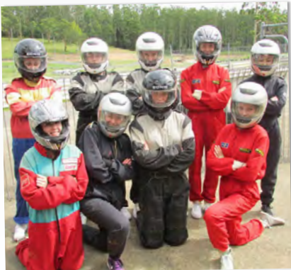
READY TO RACE