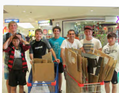
PREPARING FOR TRIVIA