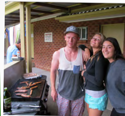
COOKING FOR YOURSELF