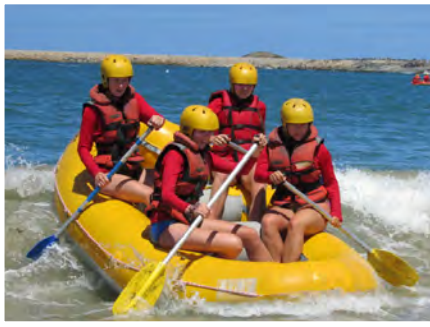
YEAR 12 STUDENTS SURF RAFTING AND LEARNING TO SCUBA