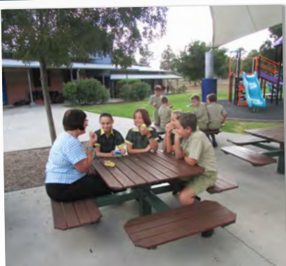
YEAR 4 ENJOYING THEIR FRUIT BREAK