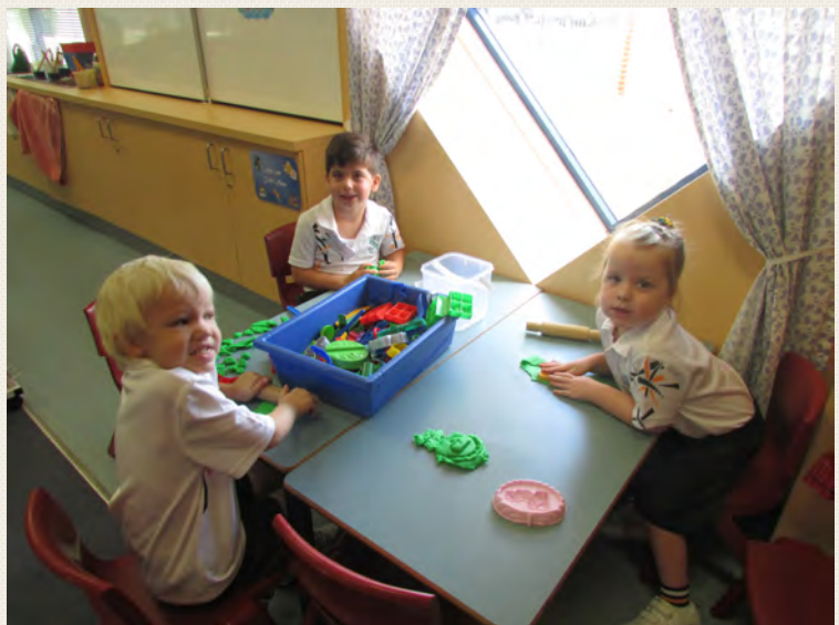
HAVING FUN IN TRANSITION