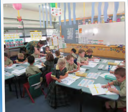
KINDERGARTEN SETTLING INTO CLASSROOM ROUTINES