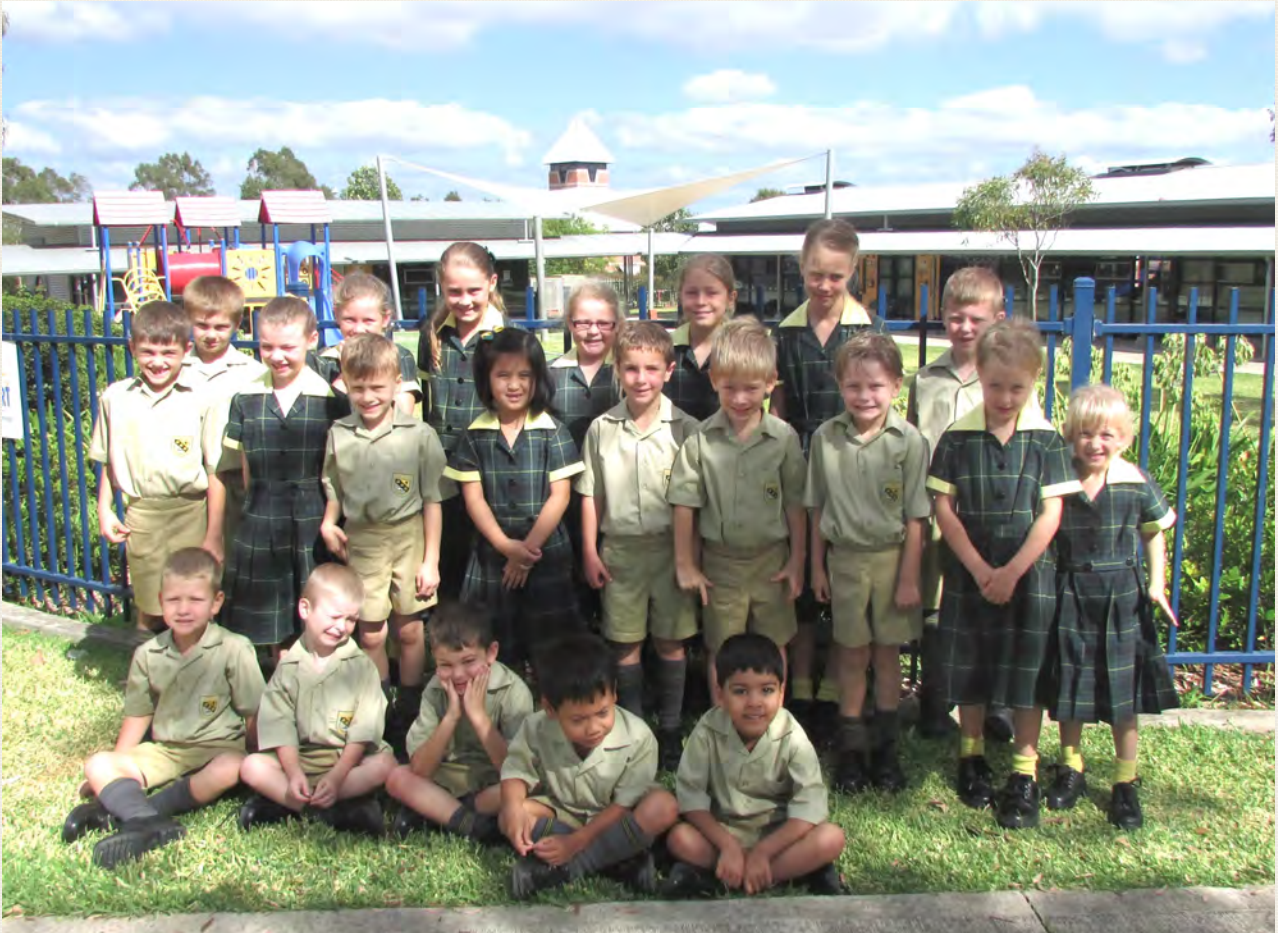
NEW STUDENTS IN THE JUNIOR SCHOOL