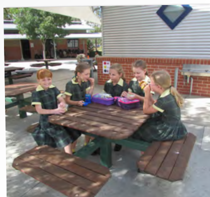
YEAR 4 GIRLS ENJOYING EACH OTHERS COMPANY